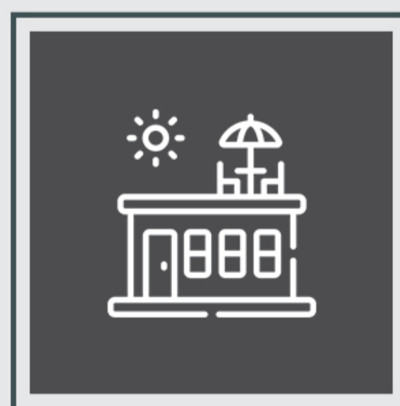
Rooftop Sitting Area