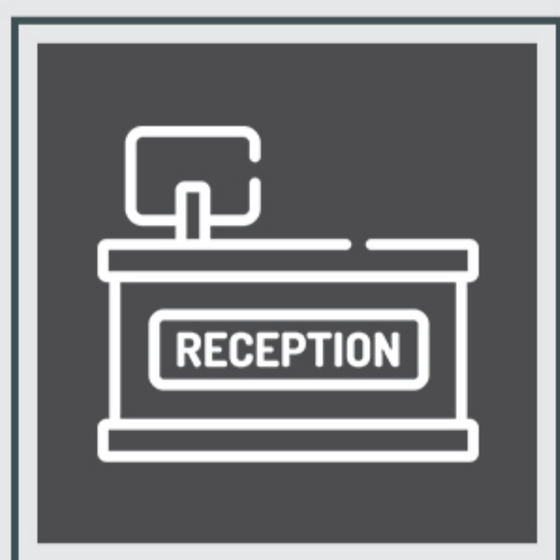
Concierge & Reception