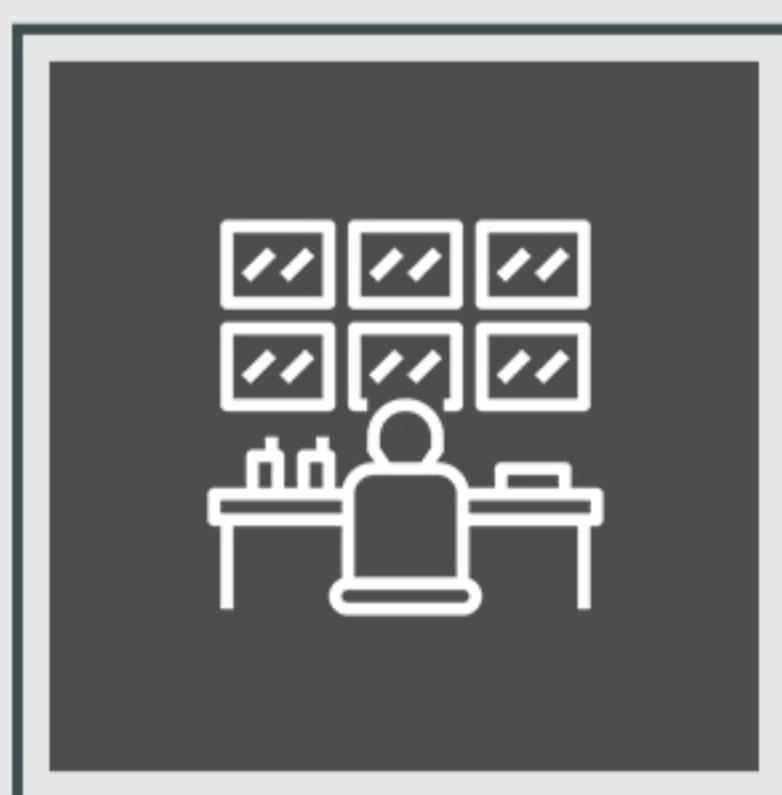
24/7 Security & Surveillance